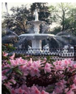
Forsyth Park Fountain