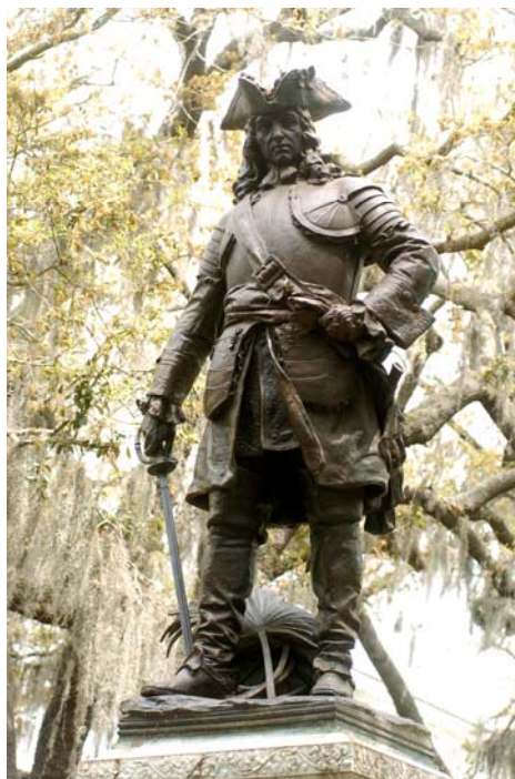
General James Edward Oglethorpe